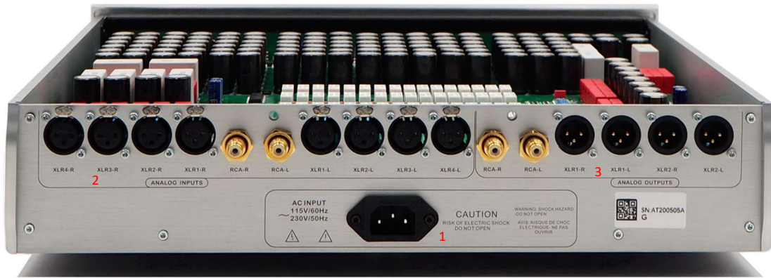
Figure 2. Rear Panel