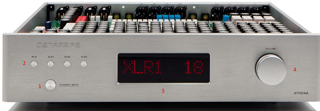
Figure 1. Front Panel